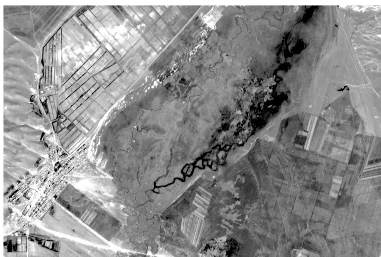
Figure 2 SPOT image of panchromatic band