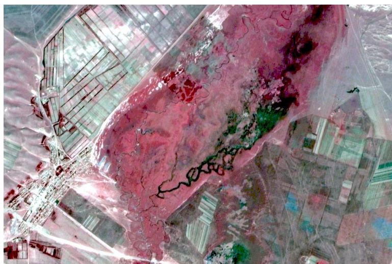
Figure 3 Fusion image of CBERS-1 with SPOT