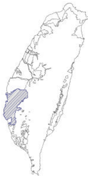
Figure 1 :The location of Chianan irrigation project

The Chianan irrigation project is located in the south-western part of Taiwan and was built in 1930. Its irrigated area is covering Chia -Yi Hsien, Chia-Yi city, Tai-Nan Hsien and Tai -Nan city(See figure1).