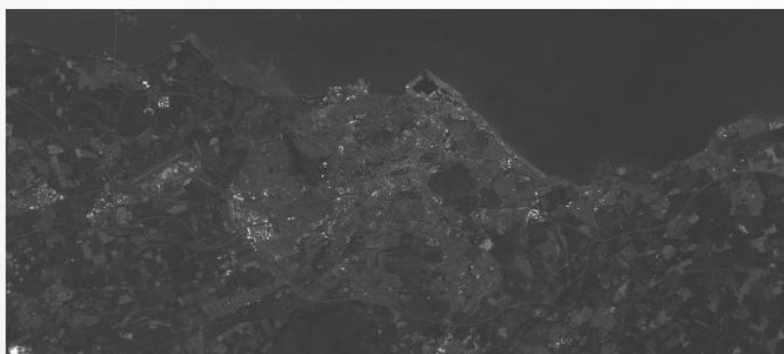
Figure 4. Interpretation Module