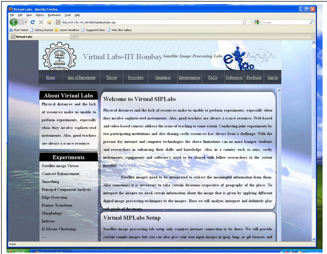
Figure 1. Front-end of the Virtual Lab

The actual experiment is implemented using Matlab and compiled into an executable that reads the relevant inputs for the experiment for a file. Using a html user-interface the user is