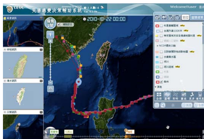
Figure 1. The operating system of SATIS

The SATIS, a decision support system, was designed to integrate the real-time monitoring data on the WEB-GIS platform for preparedness and response of typhoon hazards. The geospatial database of this platform includes the complete basic national geographic data from the National Geographic Information System (NGIS), and hazard maps indicating areas of potential landslide, debris flow and inundation made by the National Science and Technology Center for Disaster Reduction (NCDR) herself. Moreover, the real-time information including accumulated precipitation provided by the Central Weather Bureau (CWB), rivers and reservoirs status provided by the Water Resources Agency (WRA), dynamic images of potential debris flow rivers provided by the Soil and Water Conservation Bureau (SWCB), and traffic information and bridges and roads safety surveillance provided by Directorate General of Highways (DGH) and forecast information including the prediction of typhoon tracks, rainfall forecast, and radar estimate precipitation provided by the Central Weather Bureau (CWB) are all consolidation on this platform. The early warnings in accordance with hazard risk reports analyzed from the integrated information on the SATIS are delivered to the NEOC and help the decision-maker to make the right decisions in disaster preparedness. Figure 1 demonstrates the operating system of SATIS while a typhoon attracted Taiwan.