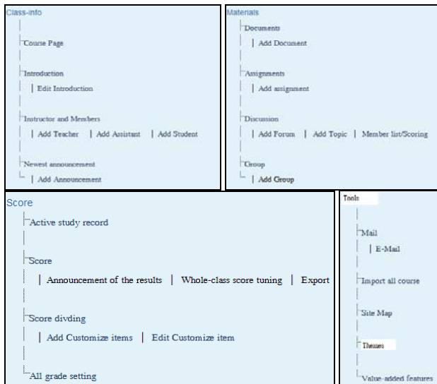
Figure 3. Site map of course.

The following section provides some statistical numbers of Surveying and Geomatics courses using E-Campus. The practical cases include the courses in undergraduate and graduate programs. They are “Surveying (I)”, “Engineering Graphic (I) & (II)”, “GIS”, “RS” and “Digital Photogrammetry”. Table 1 summaries the result of the three compulsory courses in the undergraduate program using E-Campus platform. The number of student indicates the total number of enrolled student. The compulsory courses always have more than 50 students per class. All the learning materials are uploaded to E-campus and the number of material are stated as Table 1. E-campus also records all the login information from each student. The average numbers of login within a semester are ranged from 38 to 60 times per student. The duration of semester is about 126 days. Hence, the student had logged-in to E-campus not longer than 3 days.