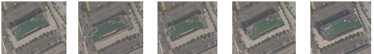
Figure 1. Overlapped Images of Test Data

The test site locates in Taipei City of Taiwan. The datasets include five Digital Mapping Camera II images with 10cm spatial resolution, as shown in Figure 1. The proposed method OBDM integrates local and global image information to match each pixel. Then we set a threshold to exclude the outliers for surface modeling. The original SGM is performed without a threshold. The method removes the outliers via that check the results of left-to-right matching and right-to-left matching in a pair. Since the OBDM is an optimal solution for all employed images, the left-to-right and right-to-left matching check does not apply in this method. Thus, this paper compares the results from the proposed method and the results without the threshold.