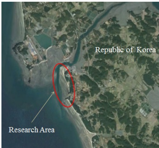
Figure 1. Coverage of this study area marked with red ellipsoid: (Image source: earth.google.com)

Surveying, and last (3) they are evenly distributed over the research area. Before the GPS-VRS surveying, they were explored to check whether they really exist, how to access them and how suitable to use GPS-VRS. The distribution of GCPs is shown in Figure 2.