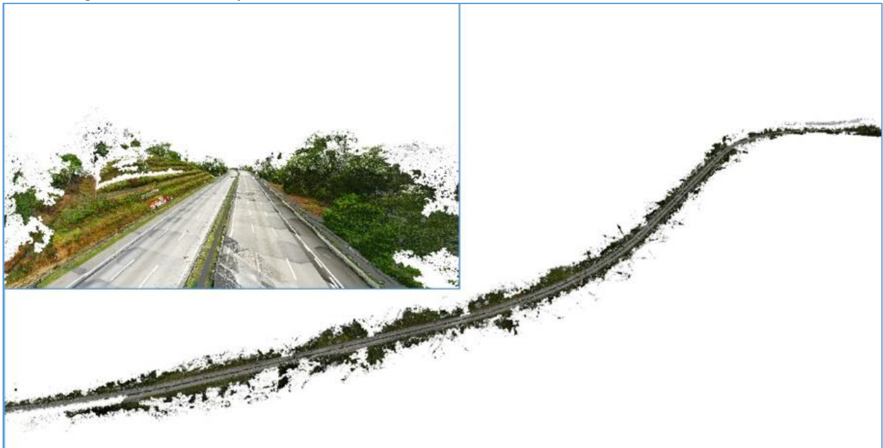
Figure 2. Mobile laser scanning point clouds collected along the North–South Expressway.

The MLS data were collected along the North–South Expressway (between 221 and 225 km) on October 28, 2015 (Figure 2). These data were obtained using Riegl VZ-2000 mobile scanner and Nikon camera D800 (30 mega pixels) on top of a moving vehicle at a speed of 30–40 km/hr. during data acquisition. To achieve the automatic georeferenced of the point cloud, the scanner was connected with Trimble Geo 7X GPS in differential mode. One scanner was permanently placed on a known station, and another was connected directly to the scanner. Both scanners received real-time correction via an interlink with the Malaysian Ministry of Lands and Survey GPS network. A laptop installed with proprietary operating software Reacquire MLS was connected to the scanning system. The laptop permitted the interactive real-time point cloud visualization for on-the-site quality assessment and decision making. The entire system was powered by an external source using a 12-volt car battery.