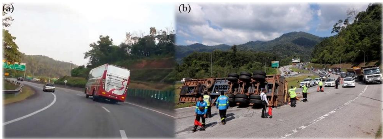
Figure 1 , Karak Expressway in Malaysia. Also known as Karak Highway is a 60-kilometre (37 mi) controlled-access highway or motorway in Malaysia connecting the capital city of Kuala Lumpur to the town of Karak in Pahang. Photo (a) shows some of the geometric features of the Karak Highway. The highway has risky vertical and horizontal curves. In addition, this highway becomes risky during the rainy days because of the presence of landslides. Photo (b) shows a road accident involving a bus and a trailer truck at KM35.1 of the Karak Highway, near Genting Sempah. The accident occurred on 21 December 2015.

Ensuring safety on urban expressways is highly important because they play a vital role during peak-hour traffic in most cities worldwide. Information on traffic accidents and on the relevant factors that affect them is significant for traffic safety management related research. Such information is also essential for establishing the relationship between accident severity and relevant explanatory factors. Accident severity can be forecasted using road geometry, road environment, human, and vehicle factors. Although road geometry is not the main cause of traffic accidents. It also can be used to forecast accident severity levels at certain extent (Bahadorimonfared et al., 2013). In addition, establishing relationships between road geometry and accident severity can be helpful in designing more efficient road design standards and can improve the geometry of roads significantly.