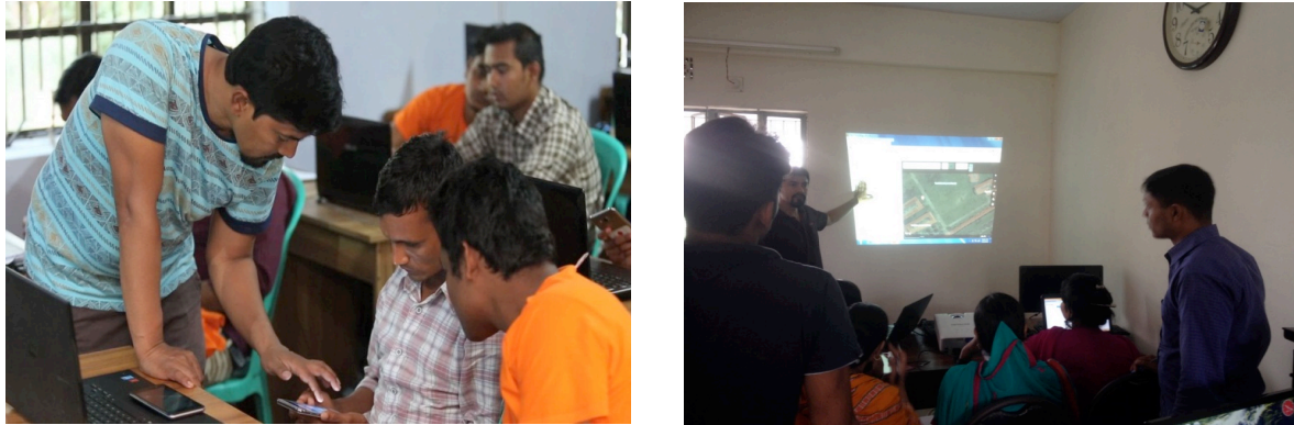
Figure 3. Trainings of volunteers at (a) Shirajganj and (b) Barguna

Bangladesh has an active and growing OSM community; first established in 2010, the self-organized group receives international funding for OSM-directed projects and many international organizations use the OSM data for their country projects. At the local level in the pilot locations, limited electricity, poor internet access, limited access to computers and low technical capacity make the OSM desktop and field validation a challenge. Volunteers from the Cyclone Preparedness Programme (CPP) and Flood Preparedness Programme (FPP) were selected from Barguna and Sirajganj, respectively, and training courses were organized in Barguna and Sirajganj to introduce OSM mapping and the mobile application geoMapTool (Figure 3). Nearly 1,000 of the 5,000 buildings which were digitized under this study, and attribute information were added through field validations.