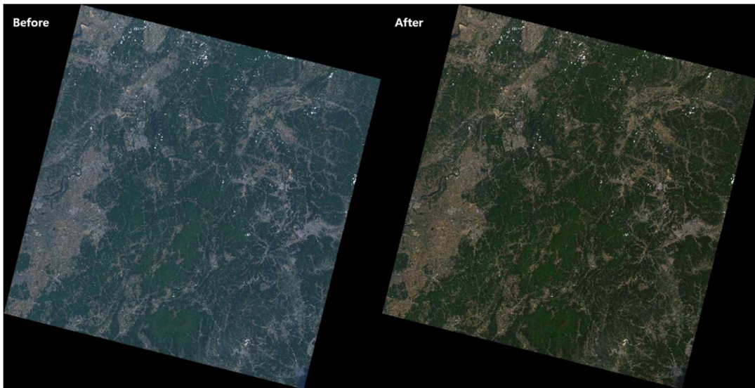
Figure 2. RGB color composite images produced from the top-of-atmosphere reflectance without atmospheric correction (left) and with atmospheric correction (right). Landsat-8 OLI L1b data acquired in South Korea on May 2, 2016.

Figure 3 shows histograms of the three Landsat-8 OLI bands (2/3/4) taken from a whole scene of Figure 2. The area is a mixture of vegetation (agricultural, forest, and mountain), urban areas. The form of histograms of the three bands appear different spectral behavior. After the atmospheric correction, peak shifting, little broadening, and reflectance reduction of the histograms are shown due to dependence of atmospheric correction. These changes are converted into increase of contrast between lowest and highest surface reflectance.