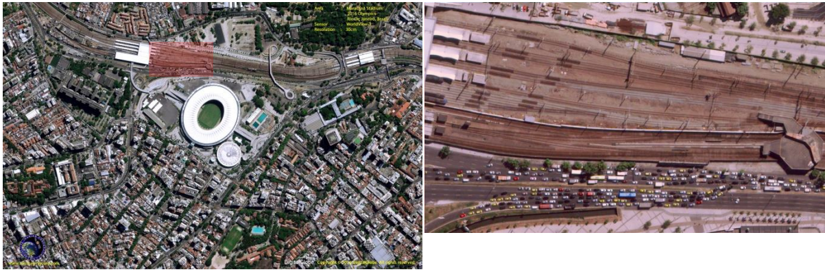
Figure 1 - Left: Worldview 3 picture of Rio Stadium. Right: Zoom of the red zone. The railway infrastructure is markedly visible, with noticeable details.