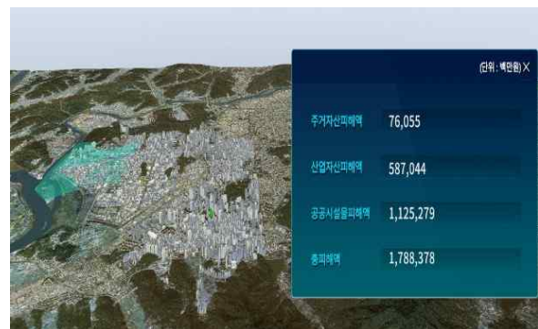
(b) Damages in the scenario of collapse of Daemyeong embankment