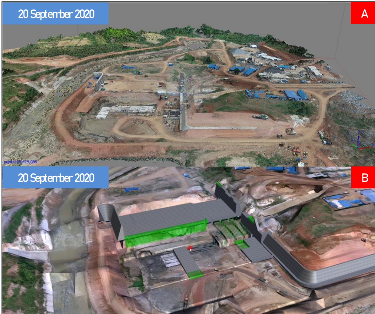
Figure 5. Comparison between point clouds as-built (A) and superimposed to 4 BIM (B)

(BIM) platforms, which have emerged as a means to integrate building design. The Point clouds is analyzed and organized for feeding into the BIM environment. In particular, the point clouds obtained from a number of positions of the scanning device have to be registered and merged. To do this, a certain overlapping between adjacent point clouds is required. Of course, the set of point clouds should cover the entire study area.