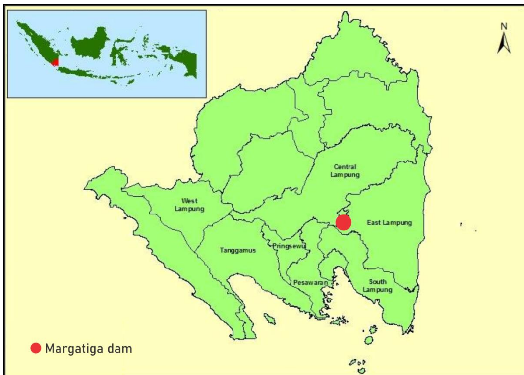
Figure 1. Location of Margatiga dam

The Margatiga Dam is located in Trisinar Village and Jemanten Village, Margatiga District - East Lampung Regency - Lampung Province. Margatiga District is part of the East Lampung Regency. The estimated area for irrigation is 10950 hectares and 65 million m 3 volume. The dam construction is carried out to meet the national food and water security targets.