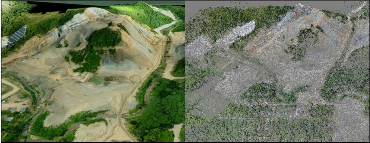
Figure 2. Automated image triangulation results for the UAV block over the dam area

For every time step a dense point cloud is generated from the oriented images for the as-built as-planned comparison.