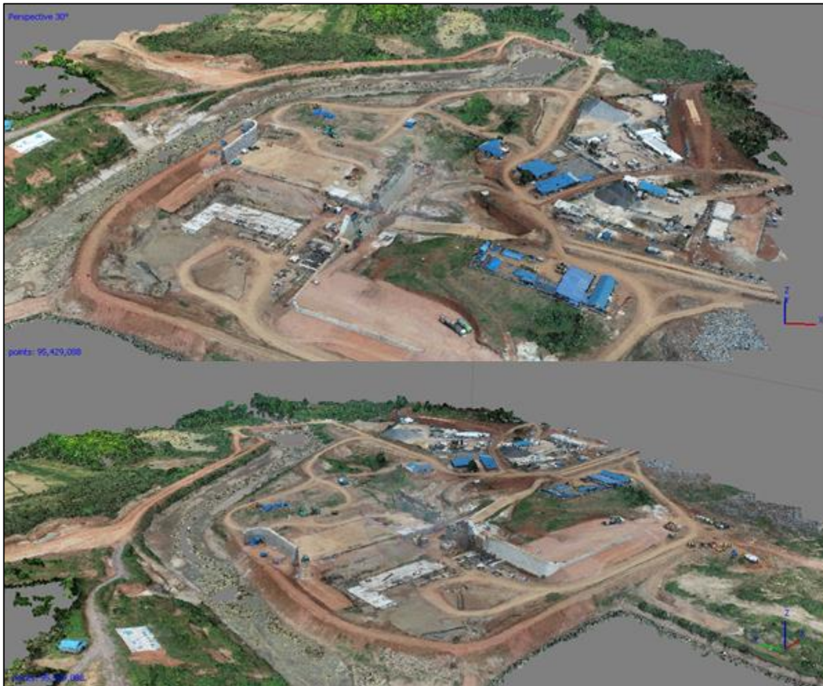
Figure 4. Point clouds generated from UAV images

Point Cloud Generation from Aerial Image Data Acquired by a small Unmanned Aerial Vehicle and a Digital Still Camera. The point cloud generated by UAV is generally in an arbitrary reference frame and needs to be registered to the coordinate system (GCPs). The point cloud below is sparse in areas of complex vegetation and where surfaces have a homogeneous texture. The flight area at the Margatiga dam site contains fields, trees, buildings, and roads with gravel and asphalt coatings. Clearly, that the point clouds below is accurate for many targets, such as buildings, roads and test site. Field surface and other areas covered by vegetation (trees, bushes, grass) are less stable targets.